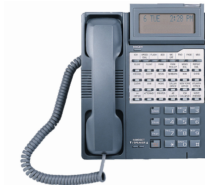
DIGITAL MULTILINE TELEPHONE WITH KEY EXPANSION MODULE, BLACK

The Digital Multiline Telephone has a built-in speakerphone, four fixed feature keys, eight feature keys with red LED's and an additional 12 multipurpose keys for feature operation or outside line appearances. Twelve multipurpose keys may be added with the addition of an key expansion module. It also includes a 2-line, 16 characters per line liquid crystal display and an incoming call indicator lamp. This display is very helpful for using advanced features and for providing status information. The oversized indicator lamp flashes red for incoming calls and green for a programmable feature such as message waiting.