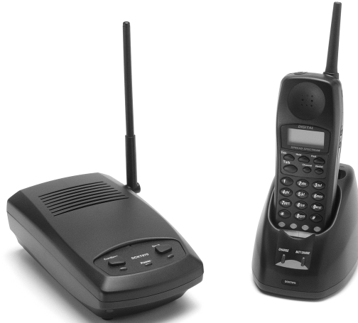
DIGITAL WIRELESS KEY TELEPHONE

The Digital Wireless Key Telephone has four feature keys (Transfer, Hold, Feature, Channel and Redial) and four function (F1-F4) keys. It may be connected directly to a digital station port, or it may share a port with a digital telephone. All of the keys on this telephone are programmable with the exception of the Talk, Channel and Redial keys which are fixed. The transmission frequency of the is between 902 and 928 Mhz.