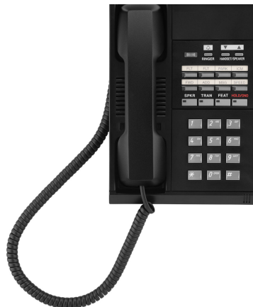
DIGITAL KEY TELEPHONE, BLACK

The Digital Key telephone is equipped with 4 Fixed Feature Keys with a red LED and 8 Programmable Multipurpose Keys with a red/green LED, and an incoming call indicator lamp that flashes red for incoming calls and green for a programmable feature such as message waiting. In addition, the digital key telephone also supports a single line/modem connection (for outgoing calls only) through an in-board modular connector. This feature allows simultaneous use of a modem while on a voice call. The digital key telephone may be upgraded with an internal speakerphone.