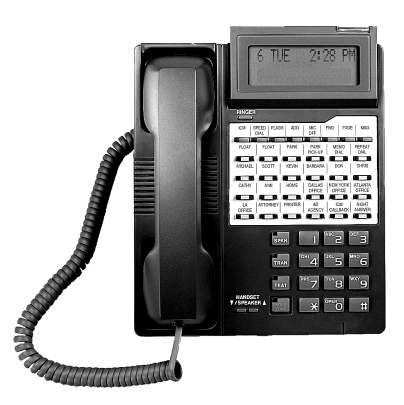
Digital Multiline Key telephone with Key Expansion Module, black

The Digital Multiline Telephone has a built-in speakerphone, four fixed feature keys, eight feature keys with red LED's and an additional 12 multipurpose keys for feature operation or outside line appearances. Twelve multipurpose keys may be added with the addition of an key expansion module. It also includes a 2-line, 16 characters per line liquid crystal display and an incoming call indicator lamp. This display is very helpful for using advanced features and for providing status information. The oversized indicator lamp flashes red for incoming calls and green for a programmable feature such as message waiting.