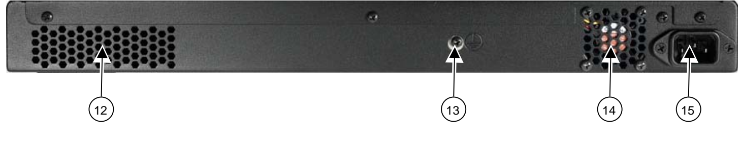
Figure 2: Rear Chassis View