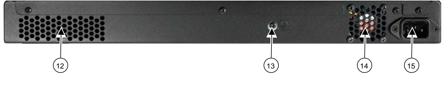
Figure 2: Rear Chassis View