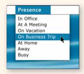
Imagine the ease and convenience!