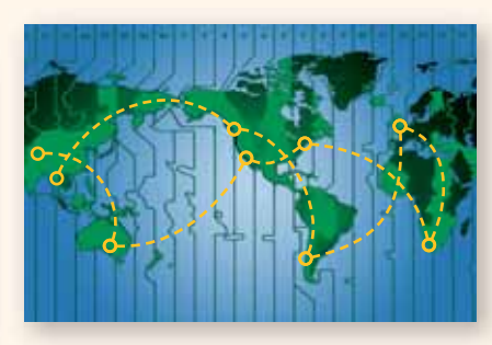
Imagine the immediate cost savings!