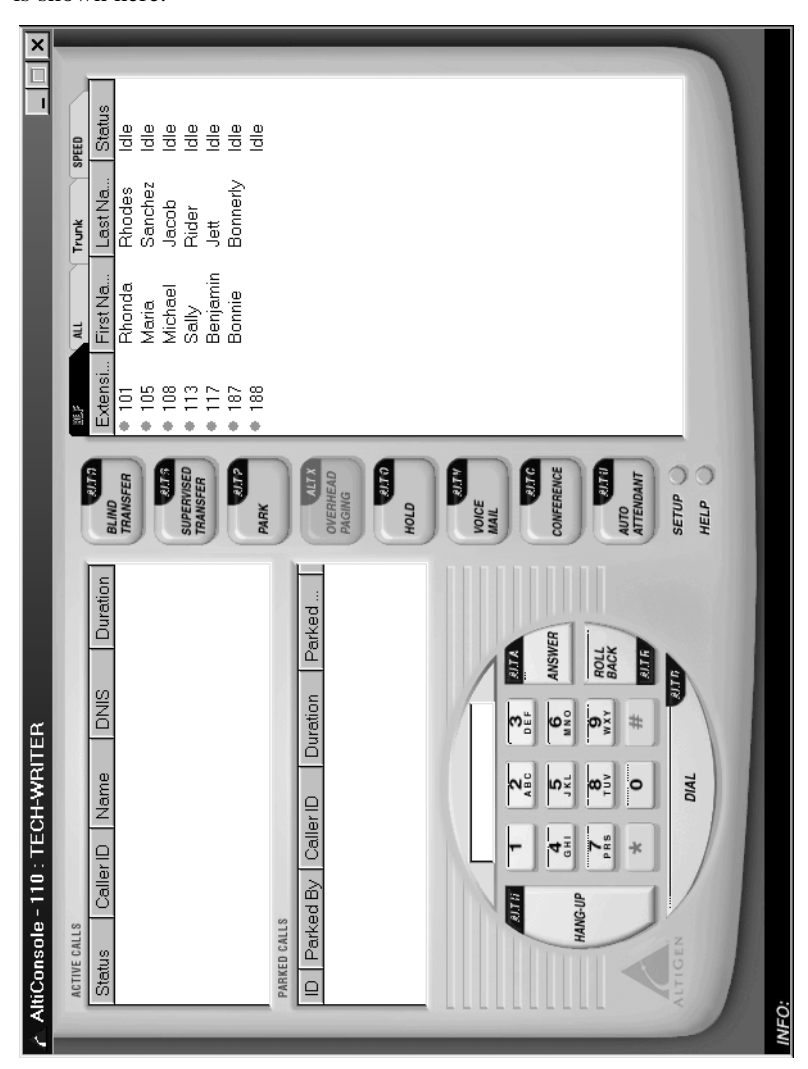
Figure 1. AltiConsole main window

When you run AltiConsole, you see the main window, an example of which is shown here.