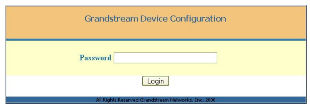
FIGURE 3: SCREENSHOT OF CONFIGURATION LOG IN PAGE

NOTE: If you cannot log into the configuration page by using default password, please check with the VoIP service provider. The service provider may have provisioned and configured the device for you. The Basic Configuration Page is the first web GUI the user will see.