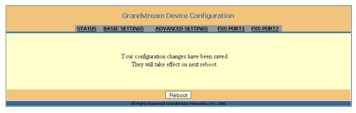
FIGURE 4: SCREENSHOT OF SAVE CONFIGURATION PAGE

Click the "Update" button in the Configuration page to save the changes to the HT-502 configuration. The following screen confirms that the changes are saved. Reboot or power cycle the HT-502 to make the changes take effect.