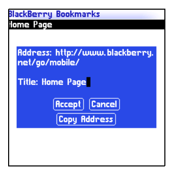
Bookmarks screen – Editing a bookmark