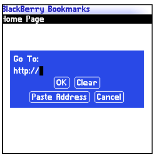
Go To field – Typing a URL