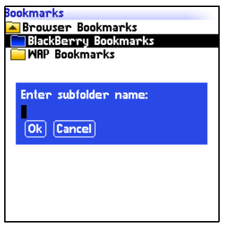
Bookmarks screen – Creating a folder