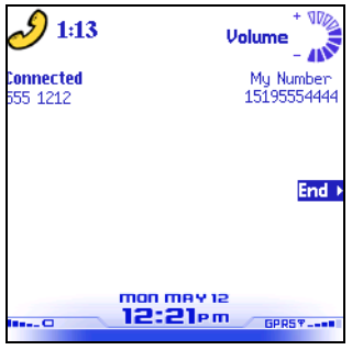
Active Call screen

5. To end the call, hold the Escape button.