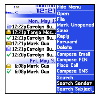
Messages screen menu – Search Sender item