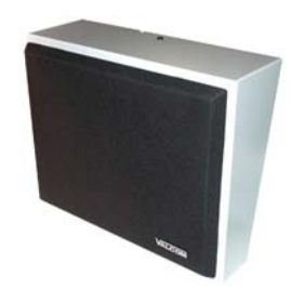
V-1052C Amplified Wall Mount Speaker Gray w/Black Grille

NOTE: Do not connect this speaker directly to a 25/70/100 Volt amplifier as damage to both the amplifier and speaker may occur. A V-1095 may be used to allow the use of Valcom self-amplified speakers on 70 Volt speaker lines.