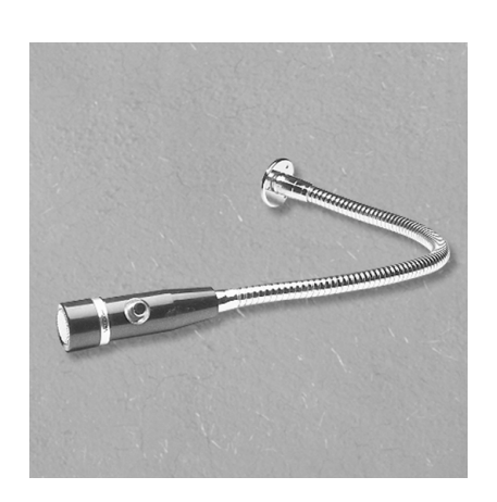
Figure 1 shows the V-450 connected to the Valcom V-9939 microphone adapter.