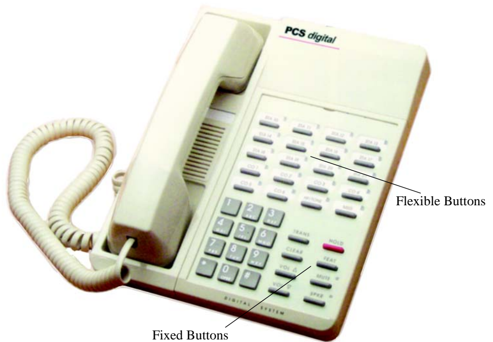
Figure 1-2 Suite 64 28-Button Telephone

Figure 1-2 below shows the keys necessary for use with this manual.