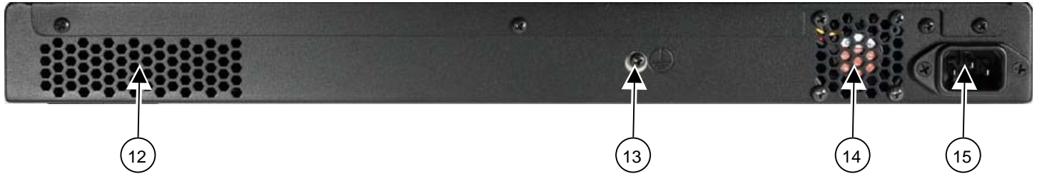
Figure 2: Rear Chassis View