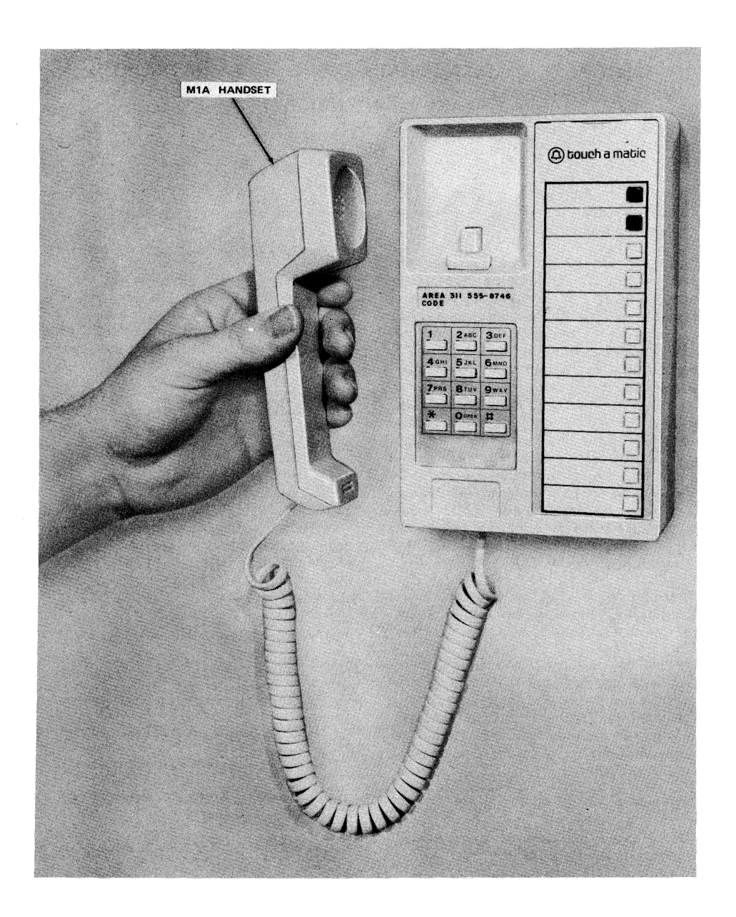
Fig. 1—5011T01A Telephone Set