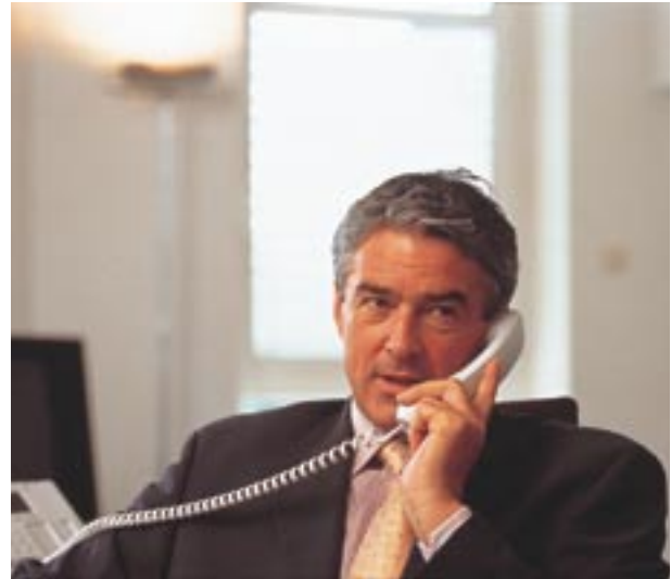
Calls can be directed to a specific individual,

To insure you are leveraging all of the advantages and cost benefits of your network the system software can automatically route calls to their destination using the least expensive path.