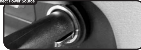
Connect Power Source