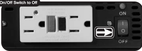
Turn On/Off Switch to Off