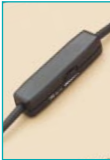
Our 0686 In-line Amplifiers provide a cost-effective option for standard carbon applications. Incredibly compact, they feature a rotary wheel for a broad range of volume adjustments. Also available with a mute button, 0686M .