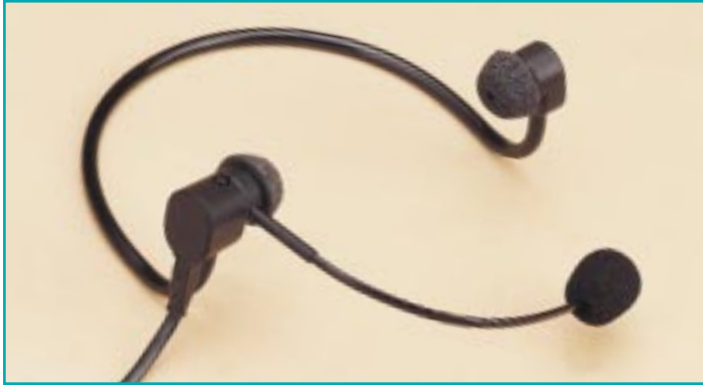
The 805-FLEX binaural headset. (Behind-the-neck style shown. The 805-FLEX can also be worn with an under-the chin style acoustic tube.)

The 805-FLEX headset gives you binaural sound without disturbing hairstyles. The unique acoustic tube delivers sound to both ears, for binaural benefit with one cord. The 805-FLEX includes two eartip styles, foam and conical.