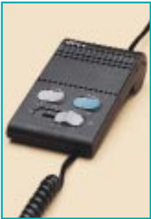
The MPA-II Multi-Purpose Amplifier works on most phone systems with a modular handset connector. The easiest amplifier to set up and use, it features a sliding volume control, headset/handset switch, mute switch and a built-in headset stand. An optional on-line indicator signals when the headset is in use.

There's a GN Netcom amplifier for every need and every application. Like our headsets, all GN Netcom amplifiers feature a two-year warranty.