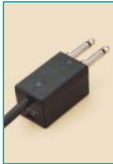
The 0452 Two-Prong Amplifier is designed for telephones equipped with a two-prong headset port. Its 3-position volume control locks your volume preference in place.

Also available: The 0911 Two-Prong 6-Wire Amplifier, for push-to-talk dispatch/911 environments; and the HT One Headset Telephone (HT-1), the first professional-quality telephone with an integrated headset—ideal for PBX and CTI applications.