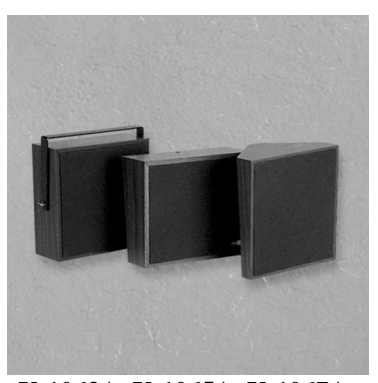
V-1063A, V-1065A, V-1067A