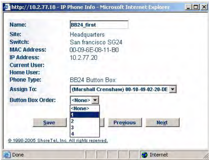
Figure 2 Select the button box order