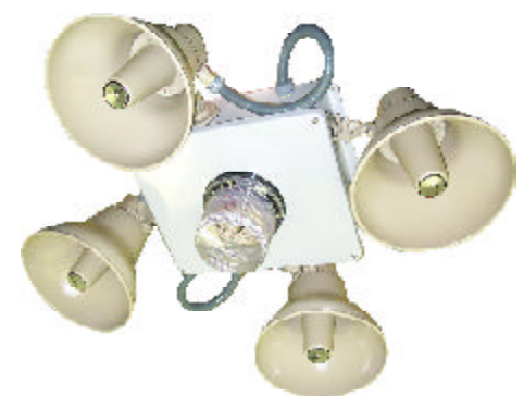
Approx. Dimensions 15" H x 36" Diameter